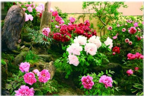
Japanese Peony House - flower of Shimane Prefecture-

“Washoku” has been recorded on the World’s Intangible Cultural Heritage.